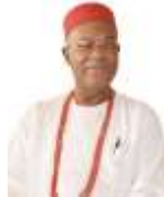
His Majesty, Nnaemeka Alfred Ugochukwu Achebe, CFR Chancellor. (Obi of Onitsha)